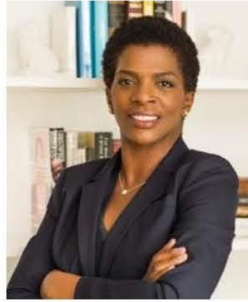
HON. DENA DOUGLAS Supreme Court Justice Kings County/Brooklyn New York City